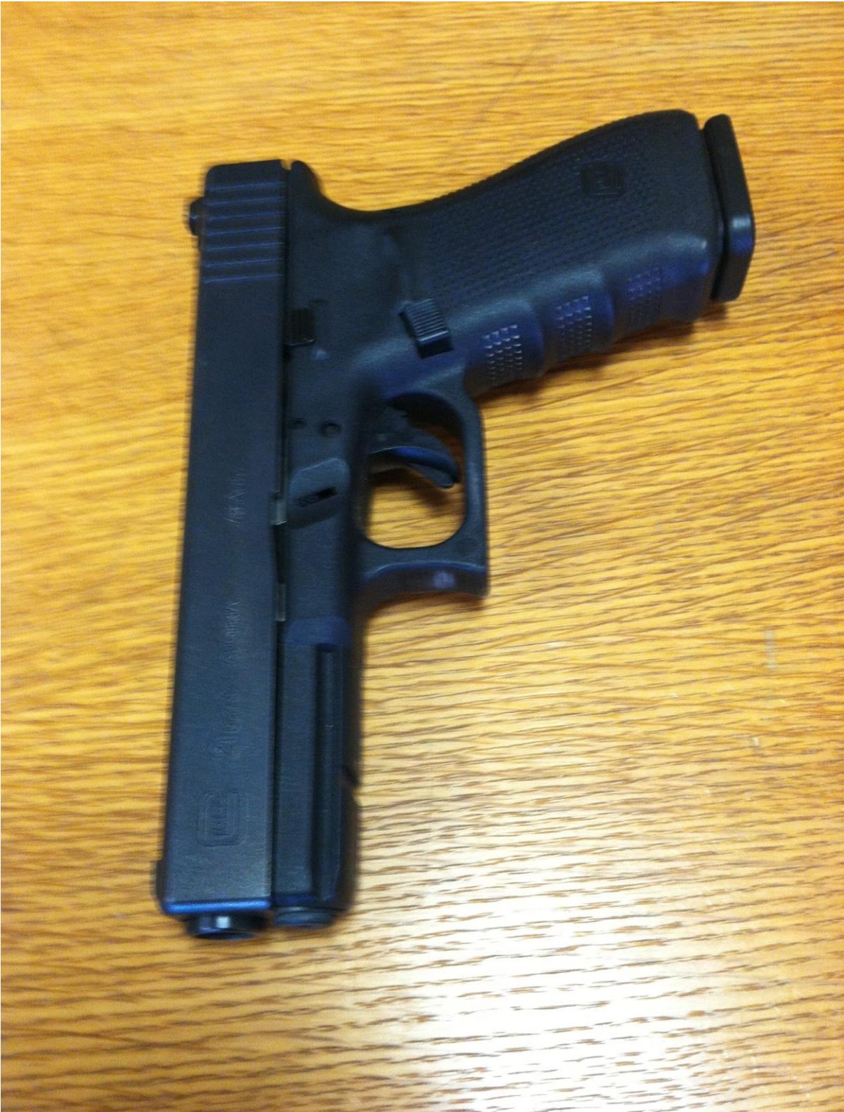
EXHIBIT #2: Lommy Green's Gun